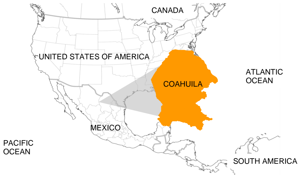
Location of Coahuila de Zaragoza in North America

Coahuila de Zaragoza is the third largest state in the country, located in northeastern Mexico and shares a 512-kilometer border with the U.S. state of Texas. In Mexico it borders the states of Chihuahua, Durango, Zacatecas, San Luis Potosí and Nuevo Leon.